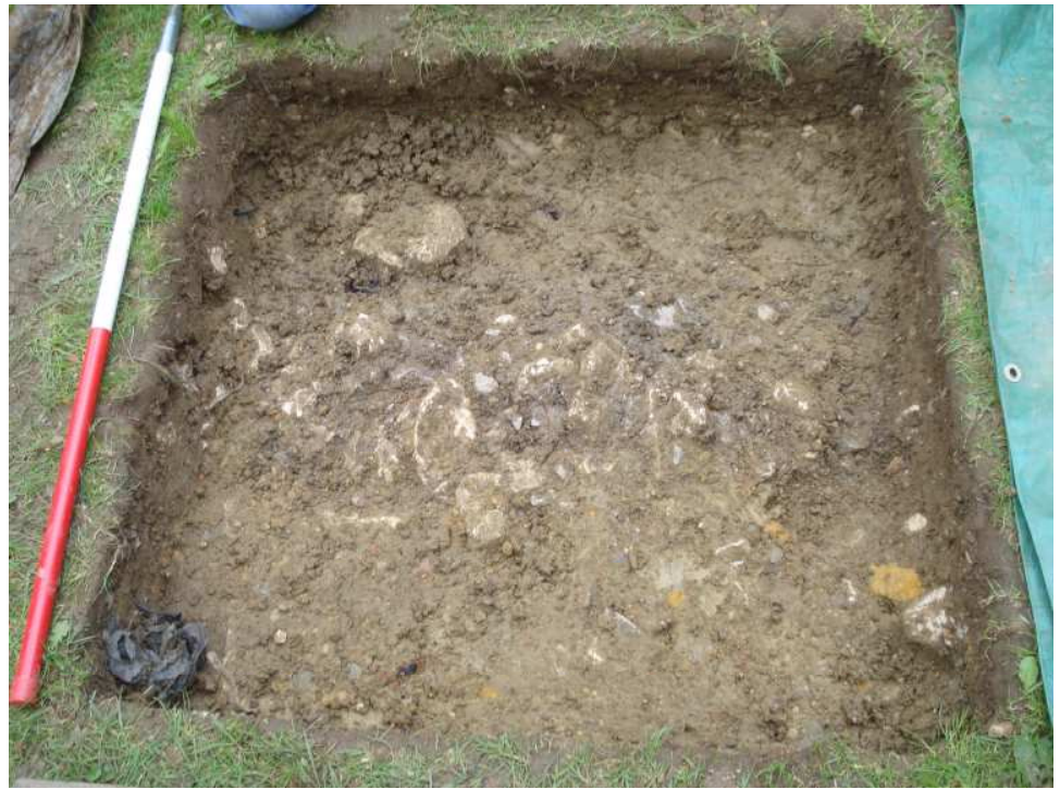
The linear feature appearing in (102)

Context (102) was more clayey, with a linear feature becoming visible as the layer was trowelled back. Below this the test pit was divided into three sections: - a structure (wall), Context [105] which ran east-west, bisecting the test pit, with layer (103) to the south of it and layer (104) to the north. The two layers were noticeably different in appearance with the northern one (104) being much darker looking, and having waterlogged wood in it. We assume [105] was a wall as it was so closely packed.