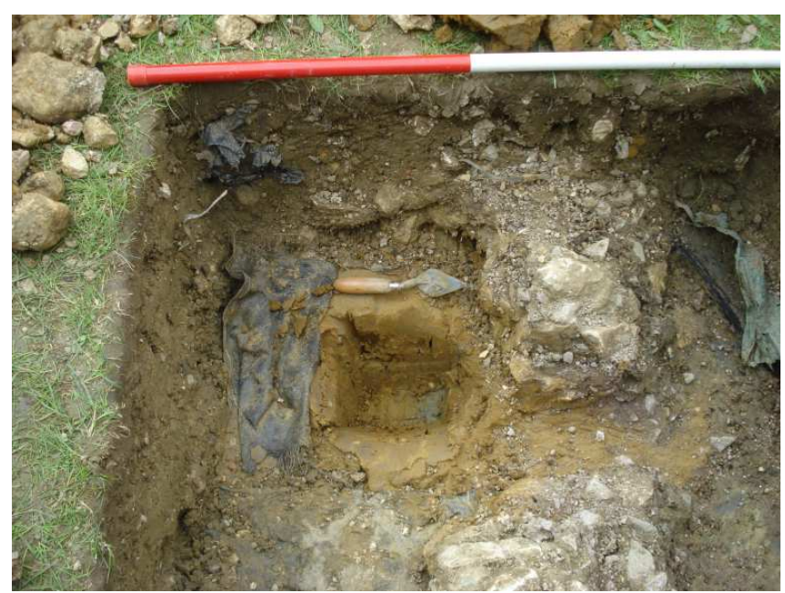
The sondage (106) showing the natural.

It was noted that there was no sign of a plough horizon, which given the past history of the site as agricultural land was taken as a sign that the topography had been significantly remodelled during the building of the estate. The finding of a dry-stone wall on top of some modern membrane was taken to be a result of a digger moving earth around. Given this we assume that most of the contexts had been recently redeposited.