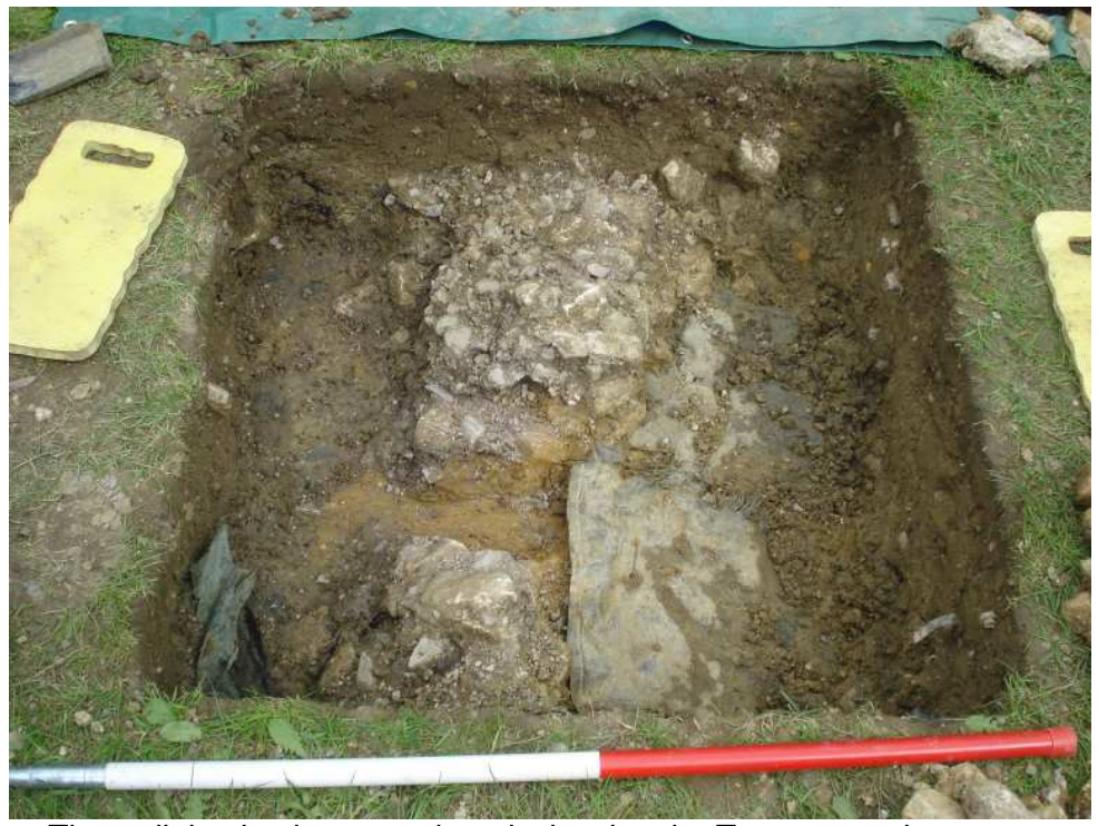
The wall, having been sectioned, showing the Terram membrane

Context (102) was more clayey, with a linear feature becoming visible as the layer was trowelled back. Below this the test pit was divided into three sections: - a structure (wall), Context [105] which ran east-west, bisecting the test pit, with layer (103) to the south of it and layer (104) to the north. The two layers were noticeably different in appearance with the northern one (104) being much darker looking, and having waterlogged wood in it. We assume [105] was a wall as it was so closely packed.