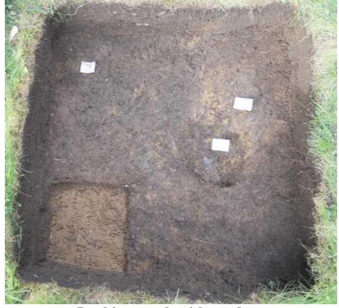
Looking north with sondage