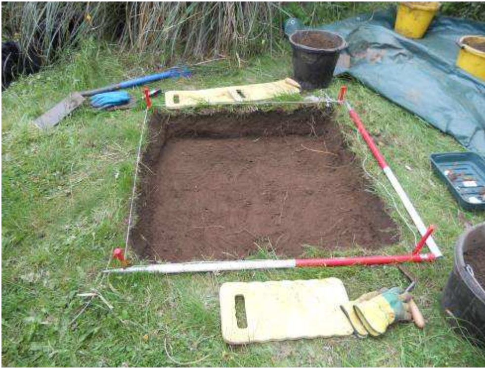
Looking south (102)