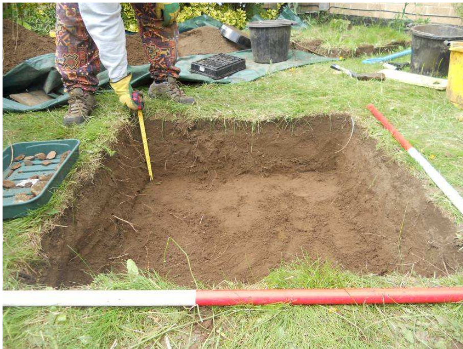
Looking west (103) – (104)