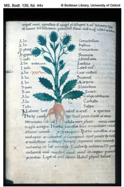
14<sup>th</sup> c. Herbal